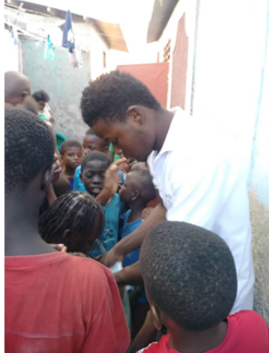
The interpreter distributing gifts the team brought to his neighborhood

Missions like these are heavily funded by donations and The Department of Anatomy and Cell Biology was happy to help. Last year we raised $500 towards the Port au Prince mission through the ACB Gives Back Event, Massage for a Cause and we're hoping to continue our support this year with another great event.