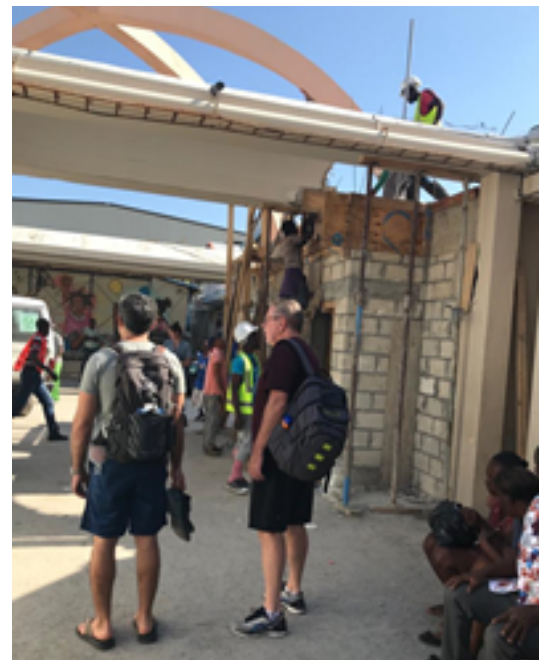
The Hospital where the team stayed

We packed 18 hockey bags of supplies and headed south on January 26th. We arrived in Port au Prince at noon on a Monday and the surgeons were immediately called to run a clinic. They ran clinic for 3 days and operated on 13 patients in the 5 days we had the OR. We returned home on the following Sunday evening.