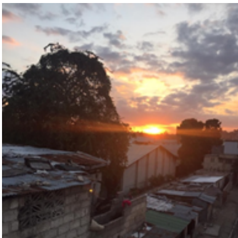
Sunset from the top of the hospital. You can see the conditions of the homes that populate Port au Prince

There were many people our team could not help, such as paraplegics from previous falls, fractures, gun shot wounds. Some of those who were paralyzed were operated on to stabilize the spine and several of those tested positive for TB, which had destroyed the vertebrae. We were able to get these patients on the appropriate medicine and arrange for follow-up clinic visits.