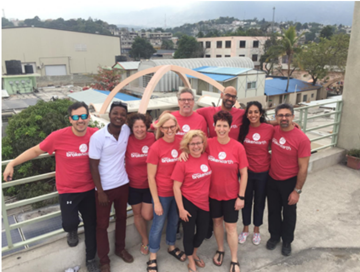
The spine surgery team from LHSC